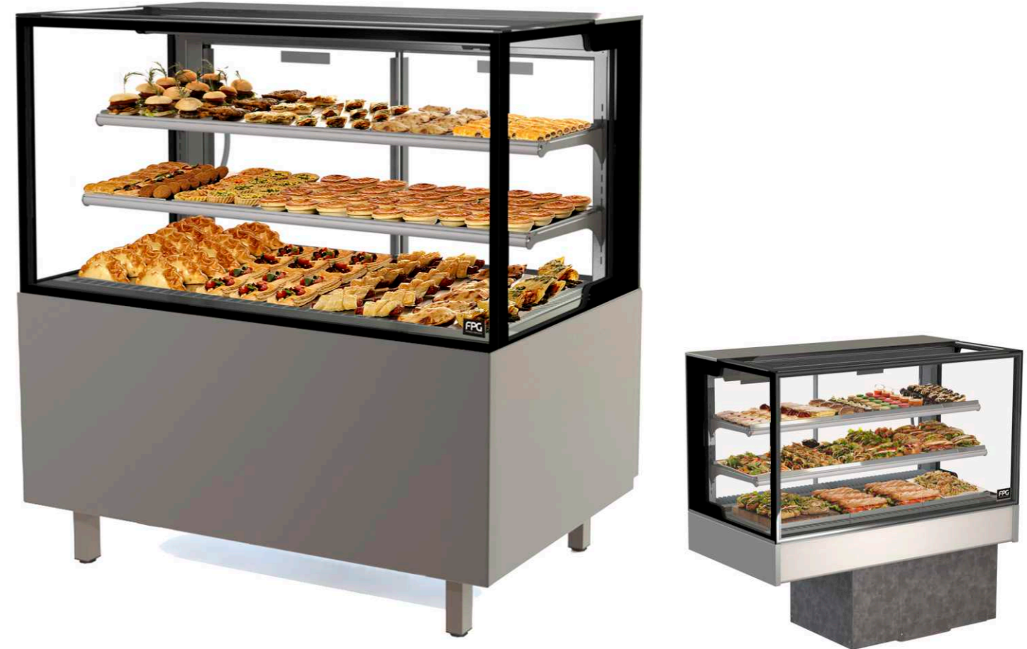
LEFT : 3000 SERIES HEATED 1200mm SQUARE FREESTANDING, WITH FIXED FRONT, WITH OPTIONAL BASE DECK TRAY RIGHT : 3000 SERIES REFRIGERATED 1200mm SQUARE COUNTERTOP, WITH FIXED FRONT, WITH INTEGRAL CONDENSING UNIT

Created as a medium duty solution for café, kiosk and c-store, these cabinets provide a plug and go solution that allows 60 door openings per hour while maintaining core product temperatures. Packaged with the same key benefits of the FPG product range, you use less energy while still maintaining food safety. The Inline 3000 construction allows for smart counter integration options of either a recessed, countertop mounting or freestanding display.